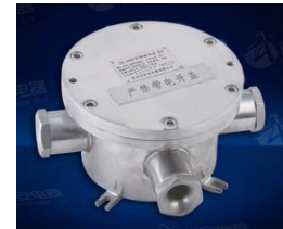
ZAJXD4 JUNCTION BOX